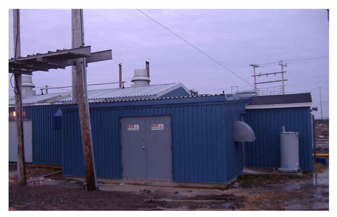
Figure 1: Black Tickle – Diesel Generating Plant

7 There have been six serious fires at these plants resulting in the loss of equipment and facilities. 8 Starting in 2014, Hydro has had multi-year program-like projects to install automatic fire 9 protection systems in diesel generating plants. Details of the program were presented in the 2014 Capital Budget Application in the Install Fire Protection System proposal (Volume II, Tab 10 11 22). To date installations have been completed in three plants. In 2017, automated fire 12 protection was installed in Nain Diesel Generating Station. In 2018, Hydro is installing 13 automated fire protection in the Postville Diesel Generation Plant. In 2019, Hydro proposes the 14 continuation of the program with installation of an automated fire protection system in Black 15 Tickle (Figure 1).