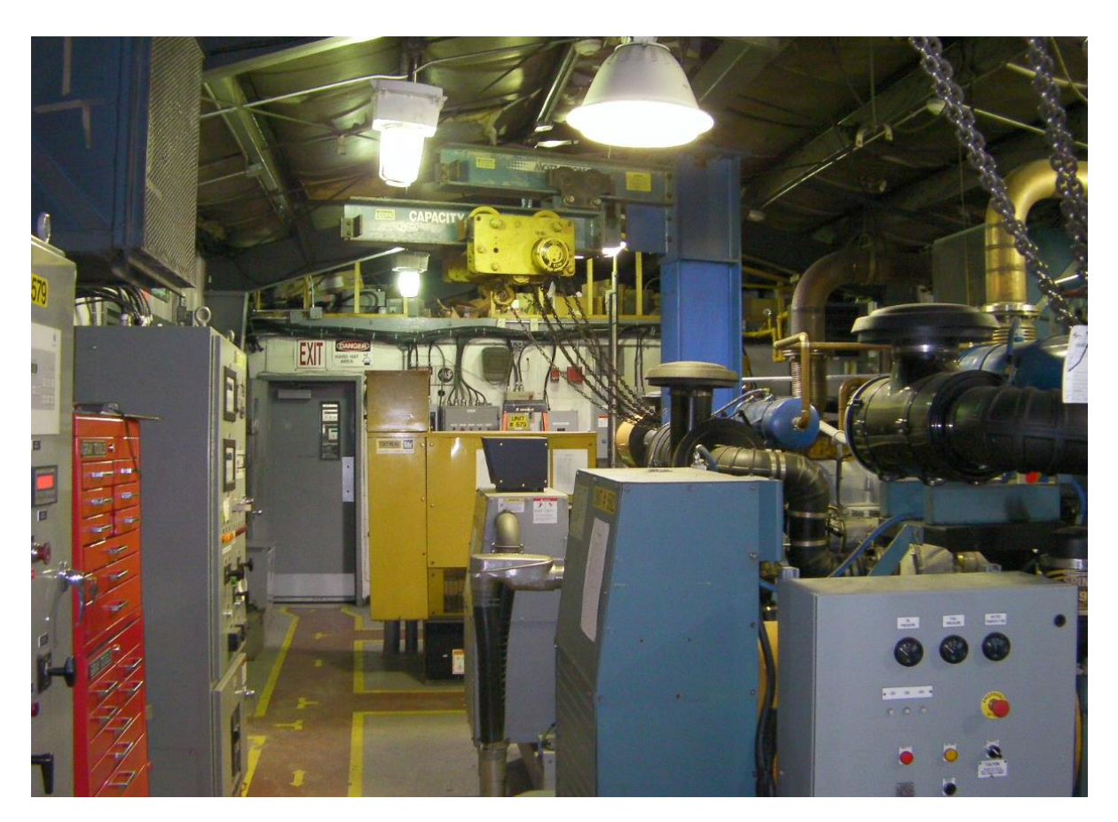
Figure 2: Black Tickle – Diesel Generators in Powerhouse

The project will install a water mist fire protection system at the Black Tickle Generating Station. The system sprays water and nitrogen, which produces a blanket of atomized water particles that absorb heat and smother the fire. This system will be used in the diesel generator main hall area (Figure 2) and other interior spaces requiring fire protection including the transformer room and the lube and coolant storage room.